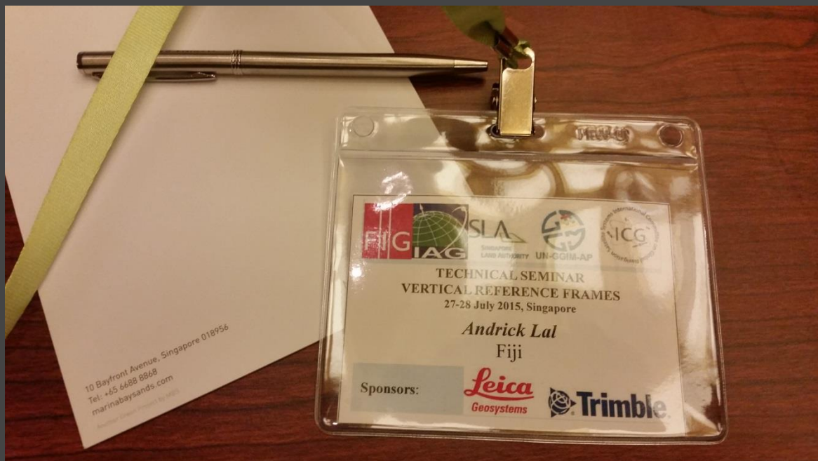
FIG Commission 5 Workshop